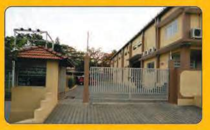
Plot No. 66-A1, KIADB, Hebbal Industrial Area, Hootagalli, Mysore – 570018, India