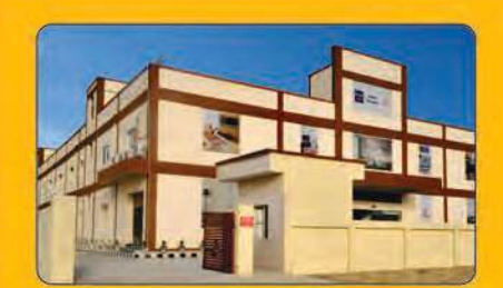
Plot No.301, HSIIDC Industrial Area, Refinery Road, Panipat Haryana – 132140, India