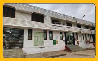
Jalalpur, Ward No.4, Station Road, Bhadohi, Uttar Pradesh – 221401, India