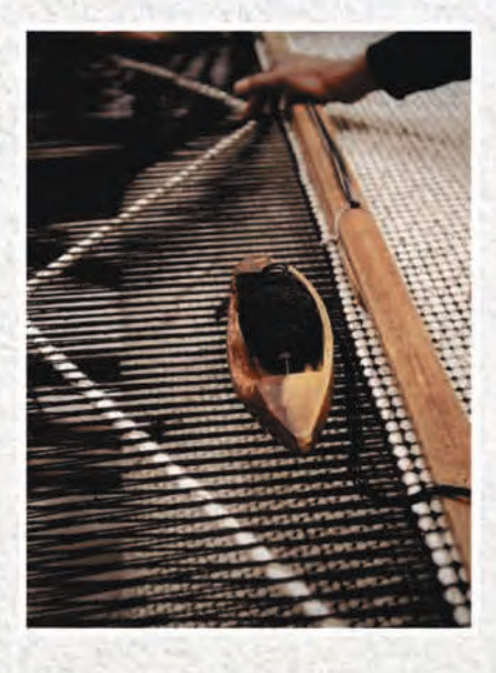
Tradition and craftsmanship unite in every woven rug.